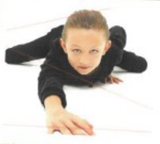
The Great Escape!

Book now at TheirCare.com.au Save up to 90% with the Child Care Subsidy