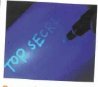
Secret Agent Kit