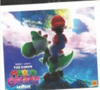
Pass the popcorn!