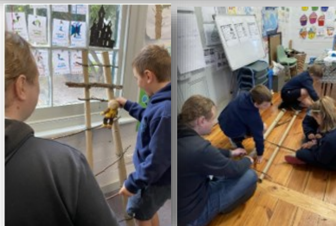
Repunzel's escape ladder