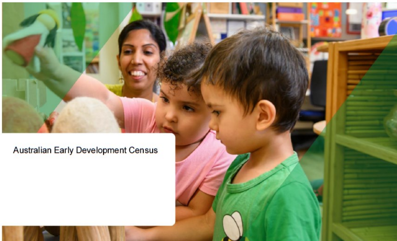
Australian Early Development Census