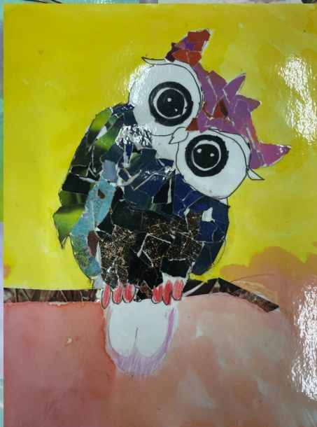
Mosaic collage artwork produced by Grd 3/4's