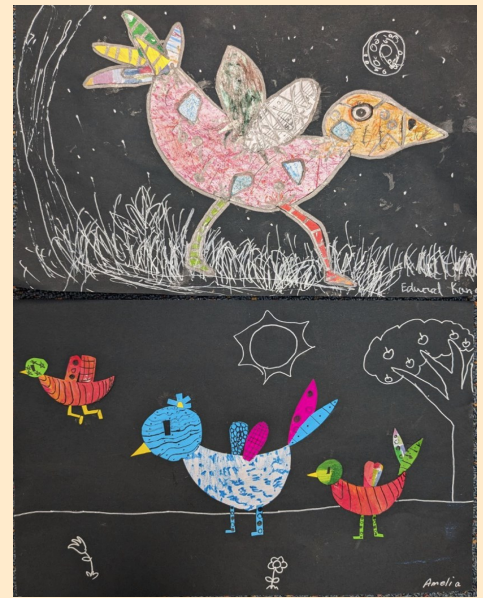
Rubbings and collage with the Grade 2/3's. Including white fine liner's for final details.