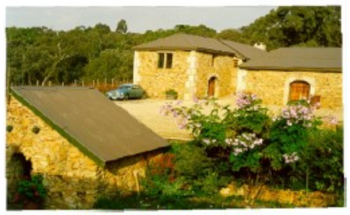
Panton Hill Vineyard and Winery