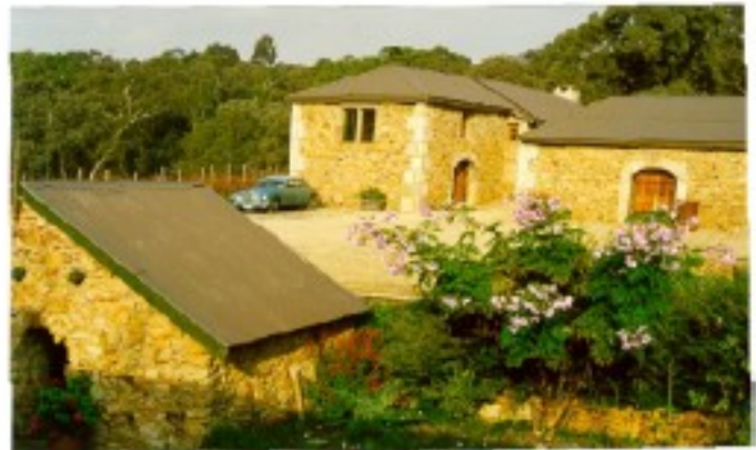
Panton Hill Vineyard and Winery